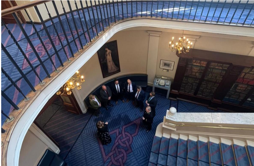
Committee visit to Dublin, 2023

39. The Chair led cross-committee international delegations and is the Senedd's representative on the UK-EU Parliamentary Partnership Assembly. Individual Committee members held relevant roles, including on the Commonwealth Parliamentary Association, the Committee of the Regions-UK Contact Group, and the British-Irish Parliamentary Assembly.