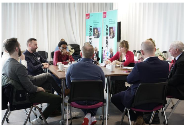
Members at an event on the video games industry, 2024

42. The Committee engaged with 962 participants in all Senedd regions in Wales, demonstrating the scale and inclusivity of this approach. 31