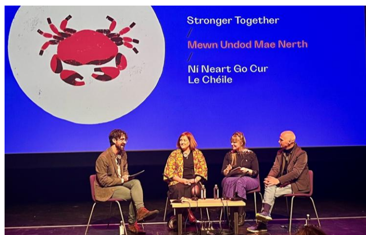
Other Voices festival, 2023

47. These lived experiences ensured our recommendations were grounded in the authentic voices and needs of people working in Wales's creative industries, and demonstrated the clear impact that public engagement has had on informing the Committee's work.