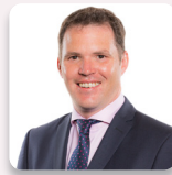
Lee Waters MS Welsh Labour