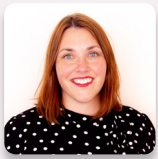
Heledd Fychan MS Plaid Cymru